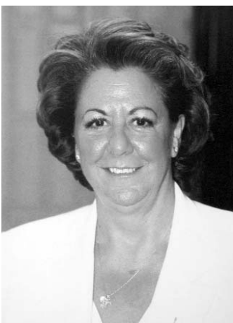
Rita Barberá Nolla Mayoress of Valencia

The Valencian people, open-minded and friendly, are happy to share our city, our projects and all opportunities offered by the city of Valencia with every one of our visitors and specially with the delegates and representatives of international businesses and institutions having special affection towards China, a country we would like to strengthen ties of friendship and cooperation with.